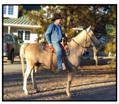
Shady... has lots of cow sense

Walking horses have an intermediate-speed ambling gait instead of a trot. The flat walk is a brisk, long-reaching walk that can cover 4 to 8 miles per hour. It is a little faster than the walk of a Quarter Horse. The running walk is the gait that walking horses are best known for. This extra smooth, gliding gait is similar to the flat walk with the exception of speed. Horses traveling in the running walk can cover 10 to 20 miles per hour, with an extremely smooth motion (no need to stand up and down in the stirrups like we do when a horse is trotting). The third main gait is the canter, which is a very easy-riding (rocking chair) lope.