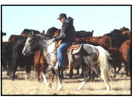
Spotted Mouse... just two years old