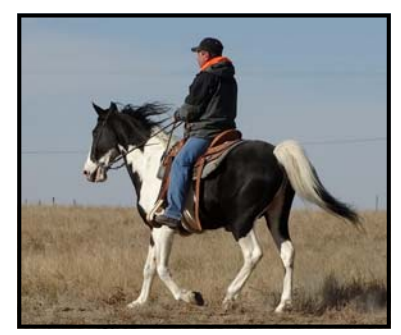
Tucker... on the move

I have long been intrigued by gaited horses like the Tennessee Walking Horse. I rode my first gaited horses in early October when we went to Tennessee for our son's wedding. I liked it. I went back in November and purchased five gaited horses. They give me a reason to get out of the office. I hope to introduce and sell some gaited horses to other western ranches.