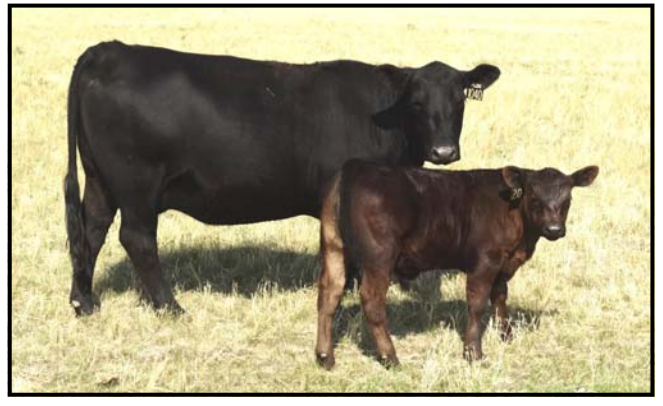
Low-maintenance first-calf heifer with her 45-dayold bull calf under severe drought conditions.