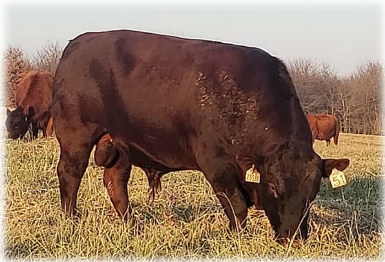
PCC Diamond at two years of age — 50% Red Angus; 50% Mashona —