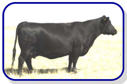
10-year-old, low-maintenance, PCC solar cows stay this fat even during a severe drought